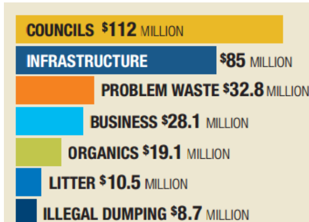
Figure 2 Waste Less, Recycle More funds allocated until July 2016

NSW EPA, Waste Less, Recycle More, Scorecard 2016, file:///D:/My%20Documents/Downloads/waste-less-recycle-more-scorecard-2016.pdf