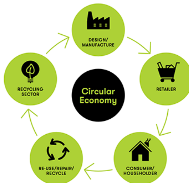
Table 8 The circular economy

Green Industries SA, What is the circular economy, http://www.greenindustries.sa.gov.au/circular-economy