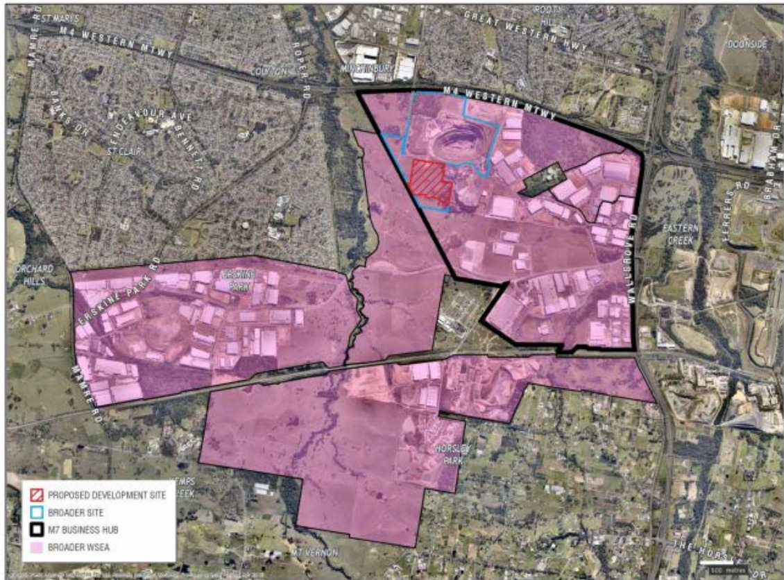
Figure 3 Map demonstrating regional context of proposed site

Urbis, Energy from waste amended EIS , p 25,